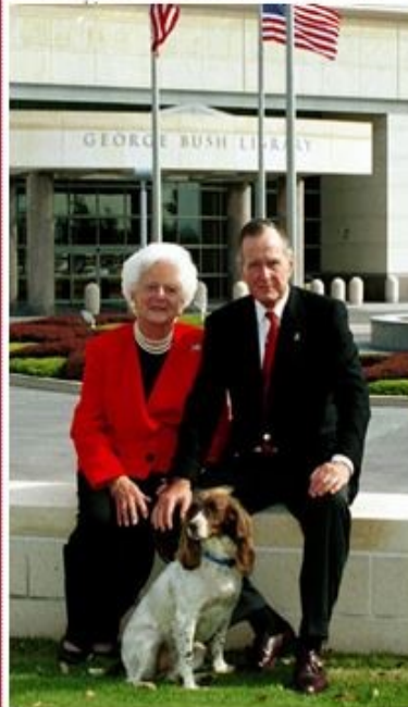
George Bush Library - College Station ..

Bus arrives at 8:30 am for a trip to College Station. First stop will be Buc-ees for a pit stop, (No Shopping). Then to the Veterans Trail, approximately 1.6 miles of informative history tidbits. Lifesize statues, plaques and a Wall of Honor. Lunch at Sweet Relish Café, then to the George Bush Library. Arriving back about 4:30 pm.