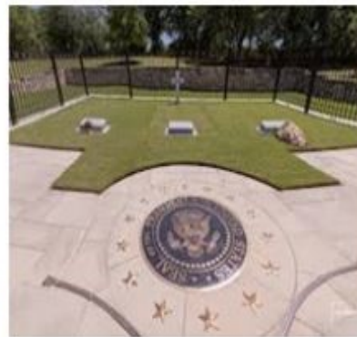
Presidential Gravesites & Tombs and ...