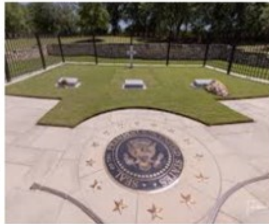
Presidential Gravesites & Tombs and ...