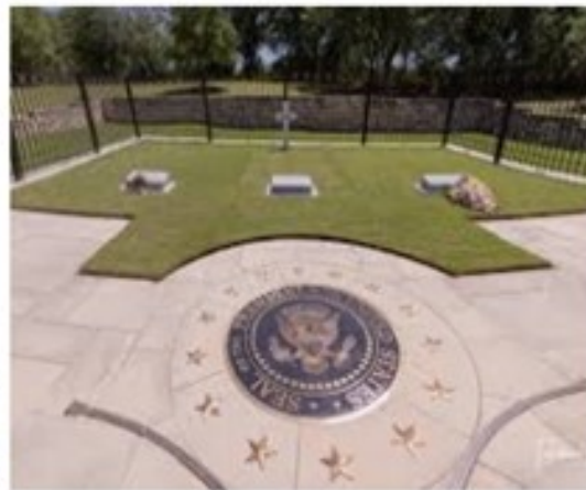
Presidential Gravesites & Tombs and ...