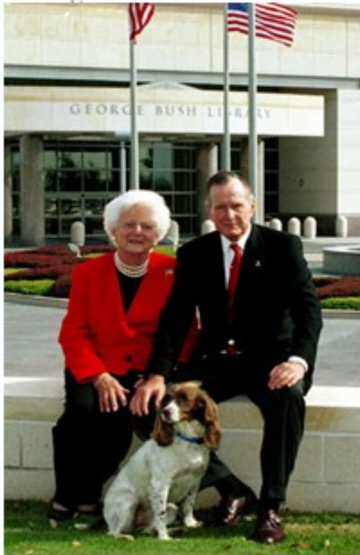
George Bush Library - College Station ..

Bus arrives at 8:30 am for a trip to College Station. First stop will be Buc-ees for a pit stop, (No Shopping). Then to the Veterans Trail, approximately 1.6 miles of informative history tidbits. Lifesize statues, plaques and a Wall of Honor. Lunch at Sweet Relish Café, then to the George Bush Library. Arriving back about 4:30 pm.