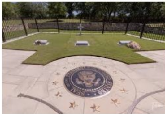
Presidential Gravesites & Tombs and ...