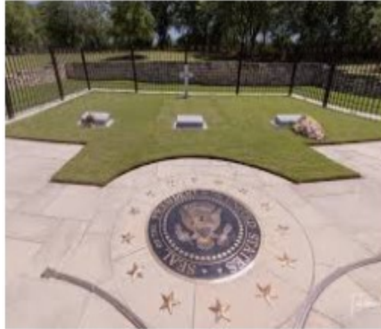
Presidential Gravesites & Tombs and ...