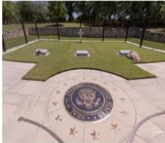
Presidential Gravesites & Tombs and ...