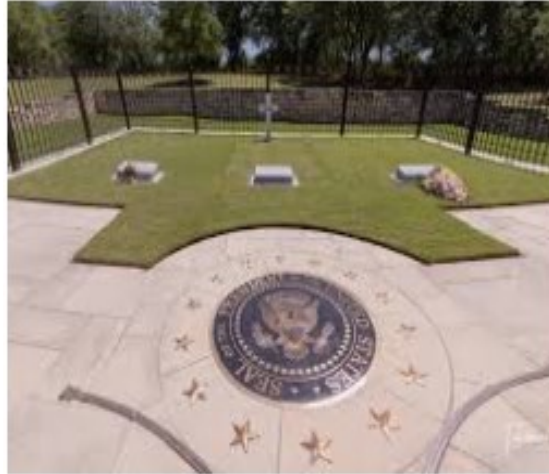
Presidential Gravesites & Tombs and ...