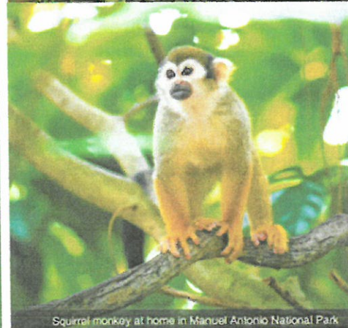
Squirrel monkey at home in Manuel Antonio National Park