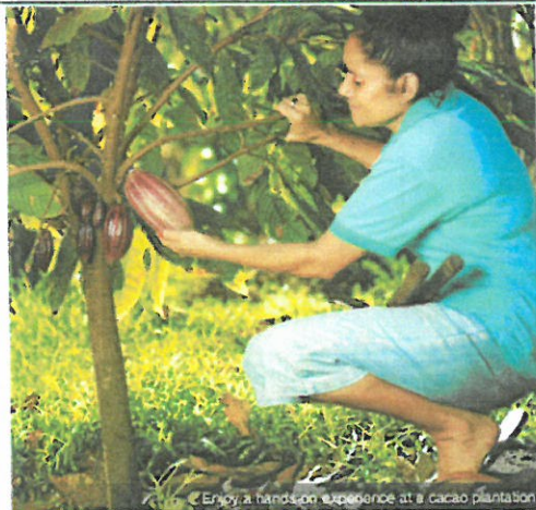
Enjoy a hands-on experience at a cacao plantation