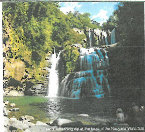
Take a refreshing dip at the base of the Nauyaca Waterfalls